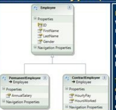
Table Per Type (TPT) Inheritance

In Parts 18 and 19 of Entity Framework tutorial we discussed how inheritance hierarchy can be represented using Table Per Hierarchy (TPH). With TPH one database table is used to store data of all the entity types in the inheritance hierarchy. The downside of this is that we have a denormalized table and some columns will have NULL values depending on the type of the derived object being saved to the database table.